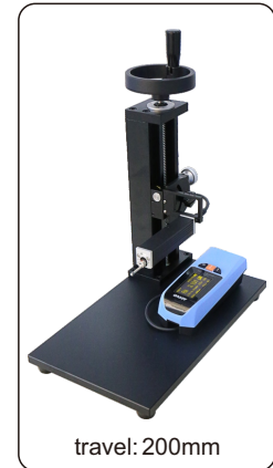
Light duty test stand SR200-STD1 (optional)