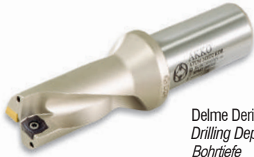
Delme Derinliği Drilling Depth Bohrtiefe