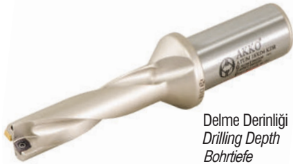
Delme Derinliği Drilling Depth Bohrtiefe

KOREA Ucuna Uygundur. / Compatible with KOREA Insert. / Kompatibel mit KRYL