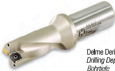
Delme Derinliği Drilling Depth Bohrtiefe