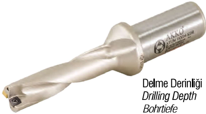
Delme Derinliği Drilling Depth Bohrtiefe

KRLY Ucuna Uygun. / Compatible with KRLY Insert. / Kompatibel mit KRYL