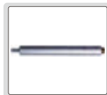
extension rod (included)