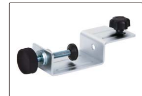
stand (included with outdoor detector)