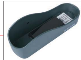
base with calibration block (included)