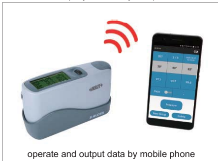
operate and output data by mobile phone

connect mobile phone via bluetooth (only Android system)