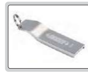
16G USB flash disk (included)