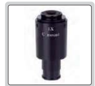
1X camera adapter (optional)