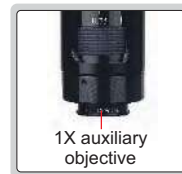
1X auxiliary objective (included)