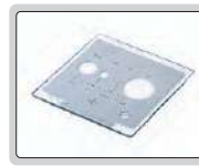
calibration plate (included)