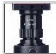
0.5X camera adapter (included)