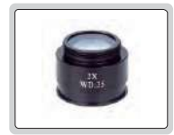
2X auxiliary objective (optional)