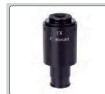
1X camera adapter (optional)