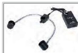
LED auxiliary illumination (optional)