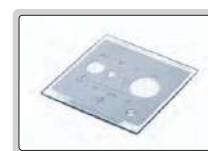
calibration plate (included)