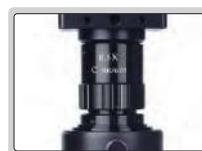
0.5X camera adapter (included)