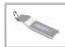
16G USB flash disk (included)